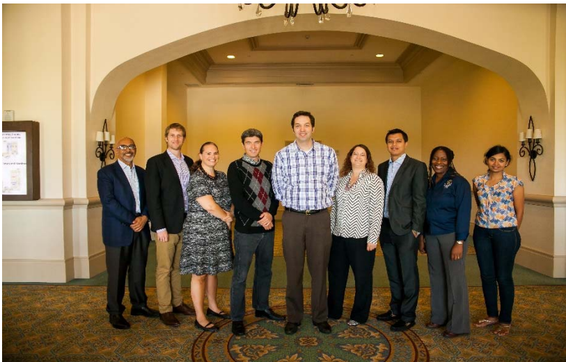
Paul R. Lawrence Fellows Pictured from L-R:

Those wishing to make a tax deductible contribution to the Case Research Foundation to support next year's fellowship program should contact caseresearchfoundation@gmail.com for more information.